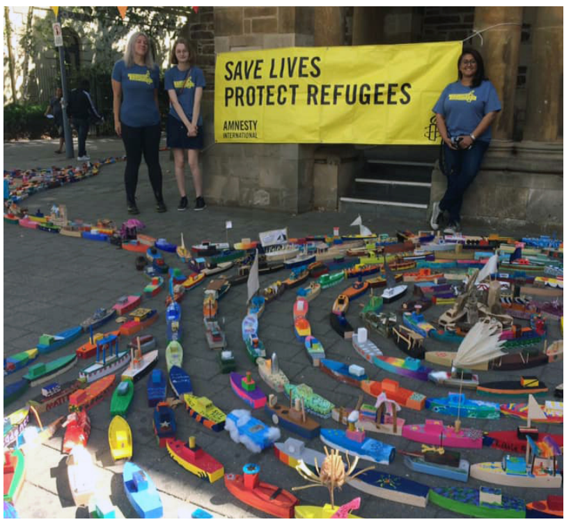
Refugee rights activism, Australia 2019.

If you have any questions please get in touch with us at <a href="mailto:activism@">activism@</a> amnesty.org.au.