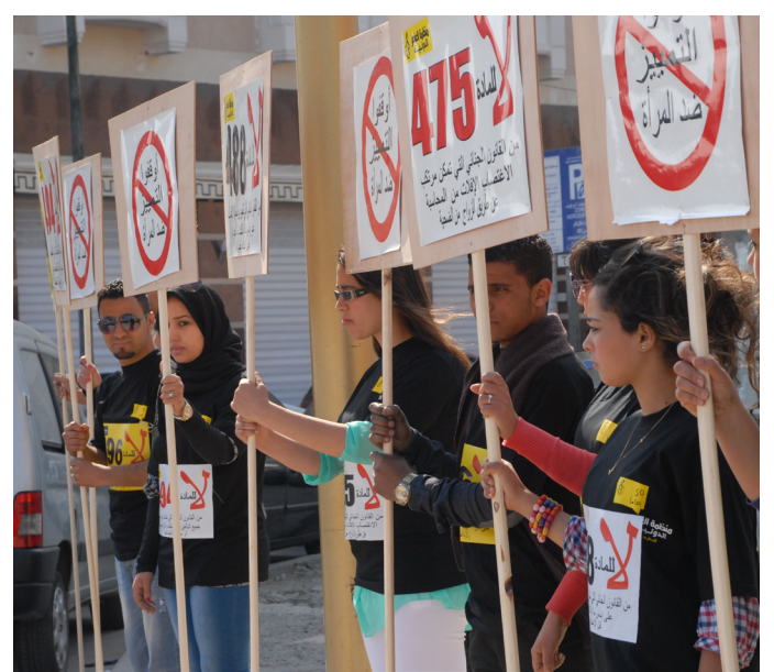
Women's rights activism, Morocco 2014.