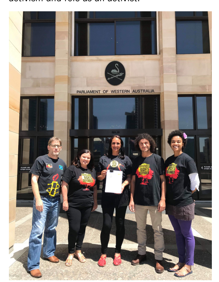
Handing over petitions, Australia 2019.

These actions take many forms and range in terms of complexity. It could be something as quick and easy as signing an online petition or communicating with a politician by letter or email. It's volunteering your time to ensure there is capacity to for deeper activism on the ground. It might be educating other people in the community on an issue and encouraging them to take action. It could be meeting with those in power face to face to tell them what needs to change. It's helping to grow a movement to increase power and impact. But it's also about doing it in a way that works for you based on your own capacity and what you're comfortable with doing. Only you can define your own activism and role as an activist.