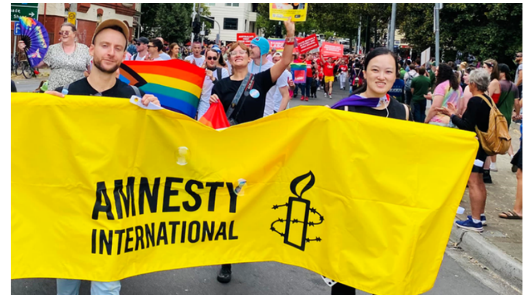
On 5 February 2023 the Victorian LGBTIQ+ Network, staff and VALC Members marched in Pride.