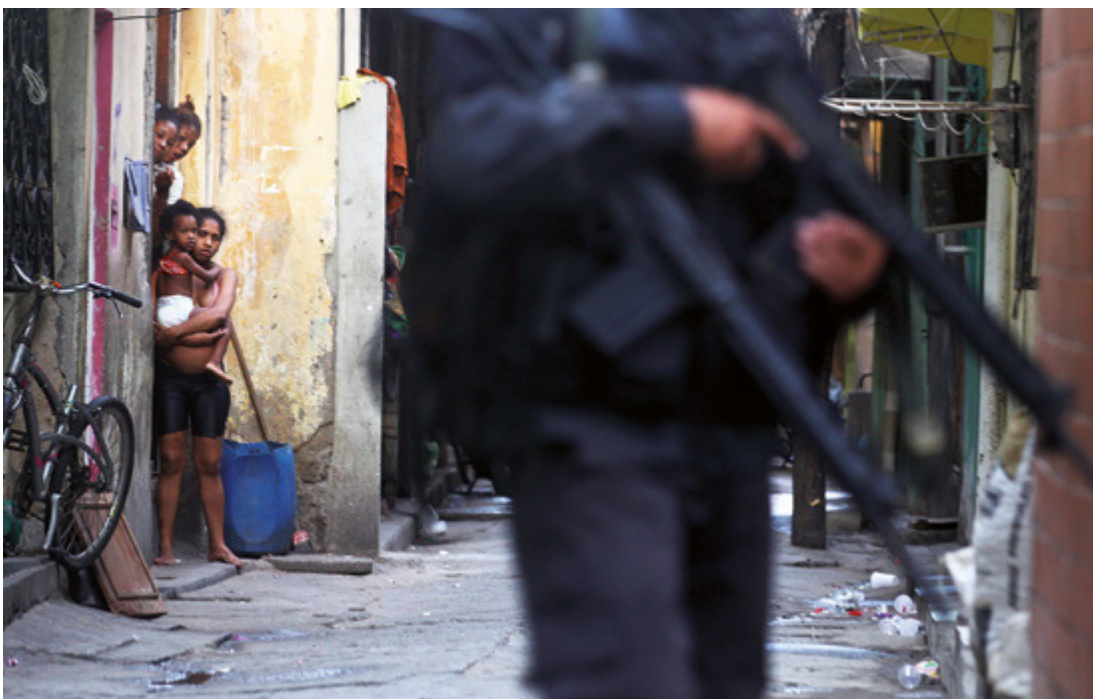
Residents look on as police patrol the streets in Brazil.

Racial justice means going beyond preventing individual cases of racial discrimination and also combating structural oppression. It involves working towards systemic change and solutions, by targeting the root causes of racial oppression as it intersects with patriarchy, colonialism and slavery as well as economic inequality.