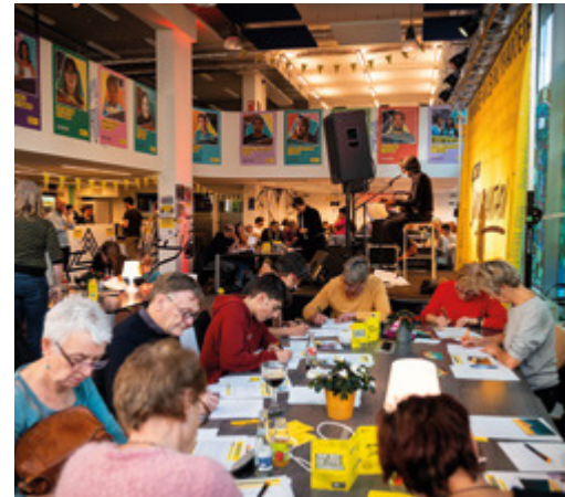
Letter writing event in Antwerp, Belgium, for Write for Rights 2022.

HAVE THE SPACE required for them to engage emotionally and develop their own attitudes.